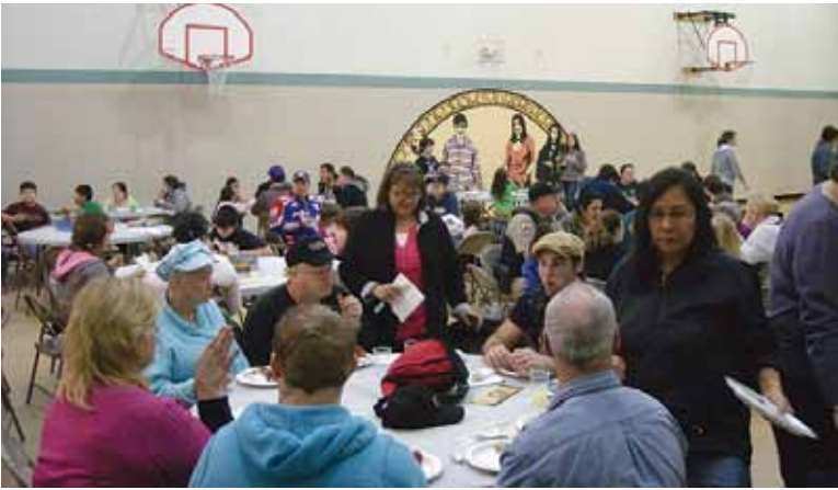
Above: Over 50 people enjoyed board games and pizza at the Family Fun Night held on Jan. 26 at the Community Center. Below: The event also promoted good health. Attendees had the option of having their blood-sugar tested prior to eating. This testing was part of the Tribe's Diabetes Prevention Program. Younger folks, age 0-6, received a free dental varnishing to help prevent early tooth decay (more information on this subject on pg. 3).