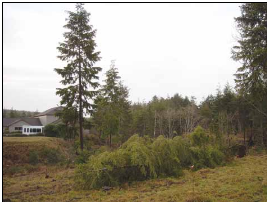
A Tree Falls at Kilkich: While not the most extensive damage that occurred on the southern Oregon coast during a mid-January week of heavy rains and winds. This fallen tree near the CIT Community Center serves as a reminder of how dangerous these storms can be.